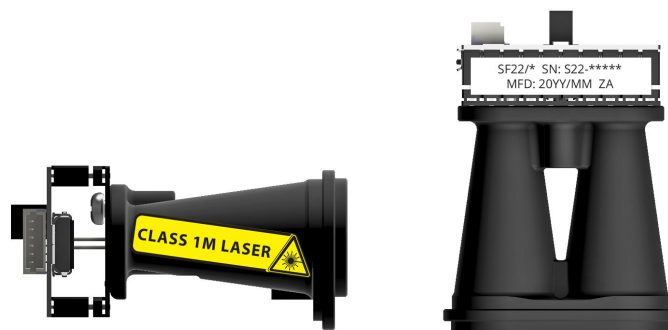
Laser radiation information and product identification labels